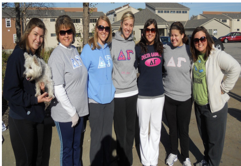
Zeta Sigma 5K October 22nd, 2011

Facebook Group: Delta Gamma Alumnae: Greater Cincinnati/NKY