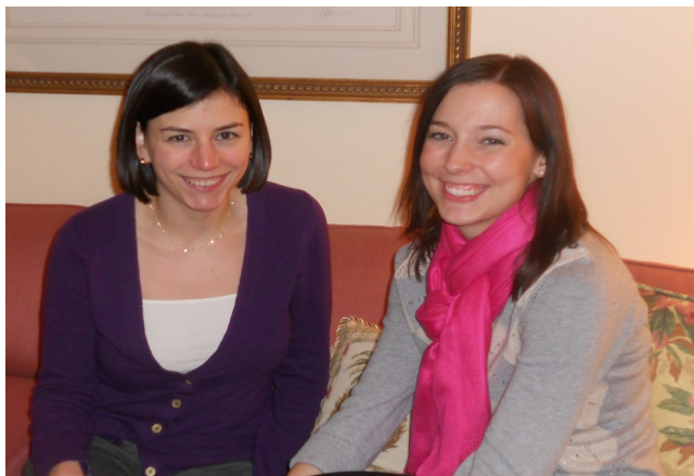
Cookie Exchange December 6th, 2011