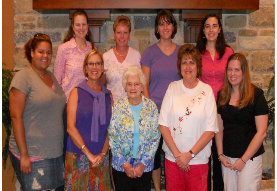
Kick-Off Salad Supper September 13th, 2011