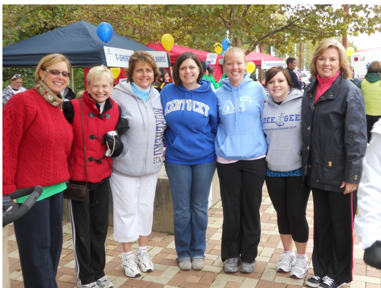
Cincinnati Vision Walk October 1st, 2011