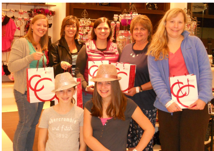
Charming Charlie Shopping Night November 7th, 2011

The Alpha Omicron Chapter at Miami University is looking for volunteers to serve on the Advisory Team and House Corporation Board. This is a great way to give back to Delta Gamma. If you are interested, please contact us at cincinnati-delta-gammas@yahoo.com . The time commitment involved will vary depending on the position. No experience is necessary, training will be provided.